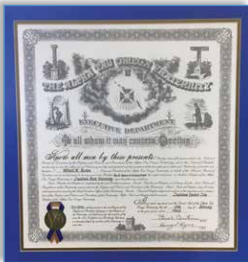
The new Epsilon Zeta Chapter charter.

Epsilon Zeta Chapter of Alpha Tau Omega at LSU