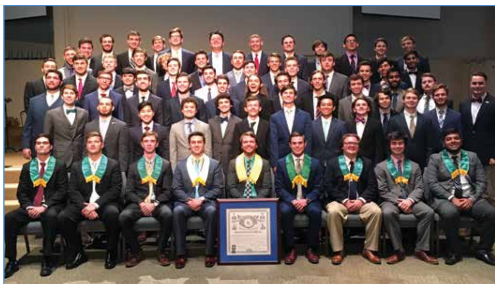
Brothers after the chartering ceremony in March.

these young men, our founding fathers, begin writing “the rest of the story.”