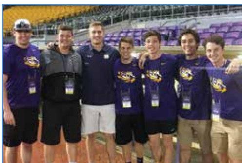
Members with Notre Dame's right fielder after working the tarp crew for an LSU baseball game.

Our GPA exceeds the all-men's average, of which we have all intentions of continuing to raise our standards. We've implemented new